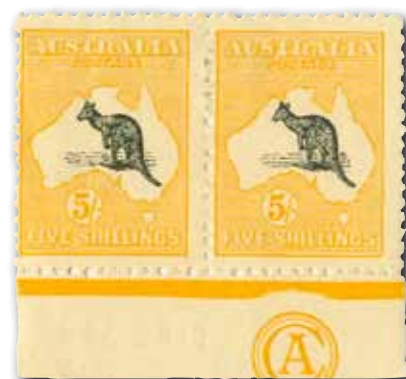
1915, Second Wmk., 5s. mint, with 'CA' monogram