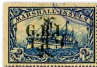
Surcharge on Marshall Islands: 1914, 2s. with surcharge double one inverted!