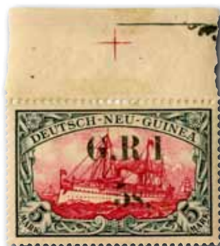
1914, G.R.I. 5s. on 5 Mark variety "no stop after I", mint