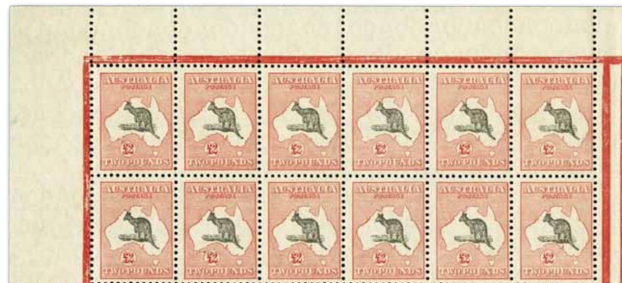
1929/30, Typographed by J.Ash, £2 mint block of 12