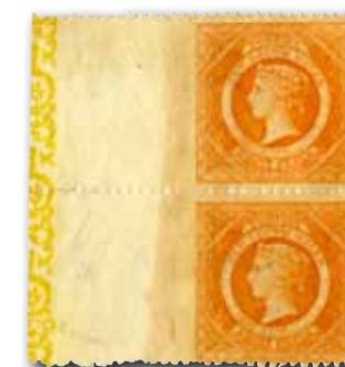
1860, 8d. orange, perf. 12