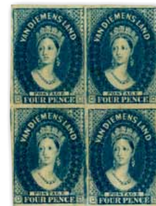
1855, Chalon Head, London Printing, 4d. unused block of four.