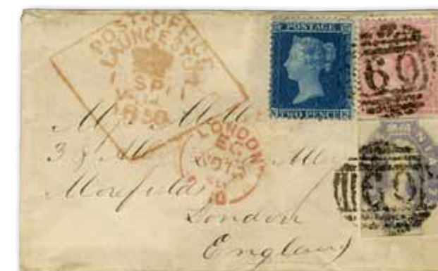
1858, Chalon Head 6d. used with Great Britain 1855/56, 2d. and 4d. to make up 1s. rate to London.