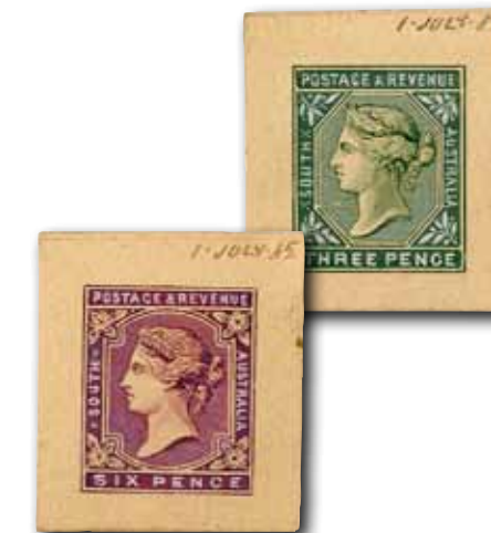
1885, De La Rue Essays 3d. and 6d., unadopted and hand-painted