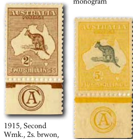
1915, Second Wmk., 2s. brown, Die II, mint, with 'CA' monogram 1918, Third Wmk., 5s. mint, with 'CA' monogram