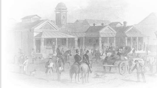
Melbourne, Post Office