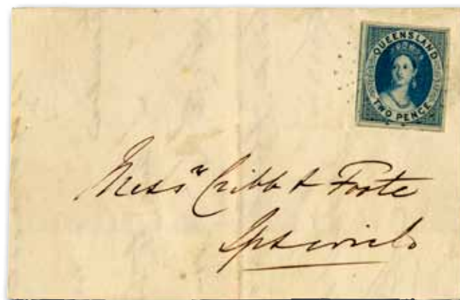
1860, 2d. blue on cover, wonderful First Issue cover!