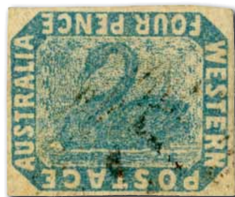
1854, 4d. 'Inverted Frame', used. Possibly the finest in private hands!

Provenance: Philippe Ferrary de la Renotière (1923)