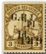
1914, 1d. with surcharge double one inverted!