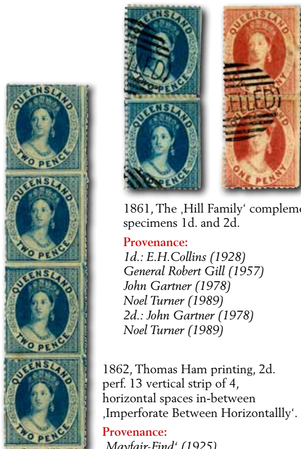
1861, The Hill Family complementary specimens 1d. and 2d.