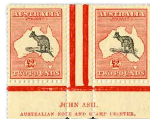
1929/30, Typographed by J. Ash, £2 Roo interpanneau pair, mint