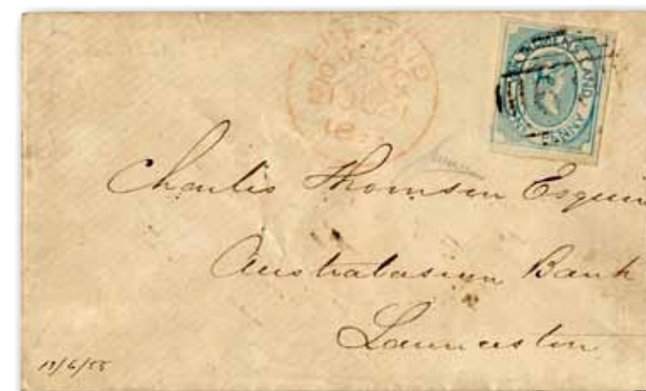
1853, 1d. pale blue on cover.