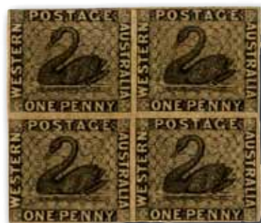
1854, 1d black, fine unused block of four.