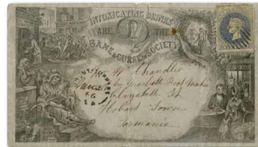
1860/69, 6d. used on illustrated cover to Tasmania!