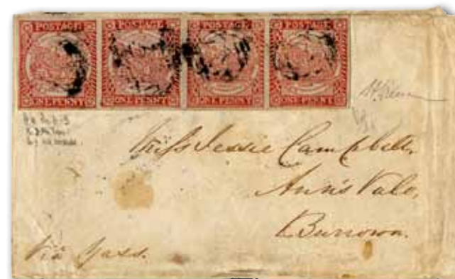
Sydney View 1d., plate II, strip of four on cover.