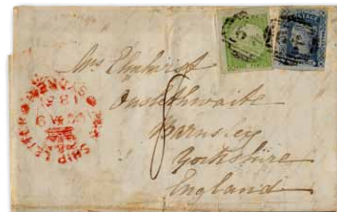
Sydney View 3d. and Laureated 2d. mixed franking!