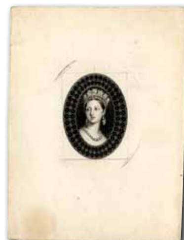
1854, Chalon Head, Perkins Bacon Die Proof by Humphrys without value, POSTAGE or country inscriptions.