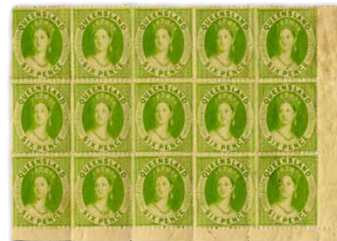
1863, Thomas Ham printing, 6d. apple green, perf 13, block of 15 mint.