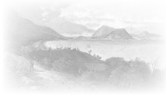
King George Sound