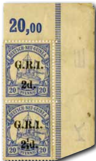
1914, 2d. in vertical pair with 2 1/2d.