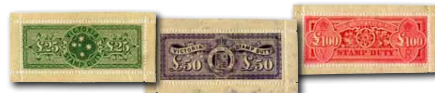
Stamp Duty: 1884/1900, High Values, perf. 12 ½, wmk. V over Crown, the set of three, superb mint o.g. Extremely rare!