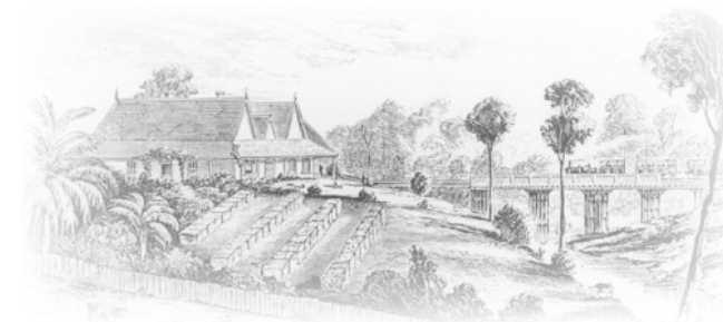
Queensland's first railway train passes over Iron Pot Gully, Ipswich district, 1865.