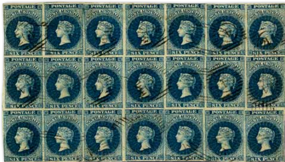
1855, Recess by Perkins Bacon, 6d. deep blue, imperforate, the famous block of 21, used.