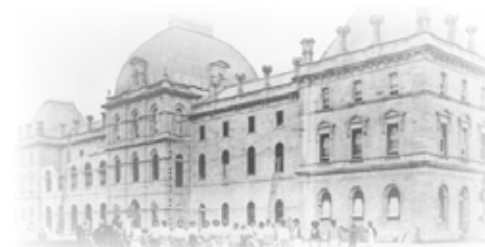
Brisbane, Parliament House