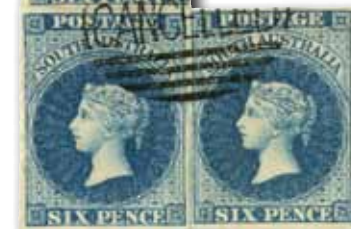
1861, The ,Hill Family‘ complementary specimens 1d., 2d. and 6d.

Provenance: 1d. and upper 6d.: Alfred Lichtenstein & Louise Boyd-Dale (1990) 6d. lower pair: Colonel Napier.