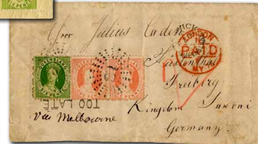
1868/74, 1d. pair and 6d. on cover to Germany.