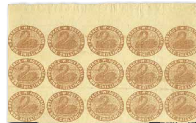
1855, 1s. pale-brown unused block of 15.