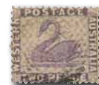
1879, 2d. mauve, Error of Colour, very fine used.