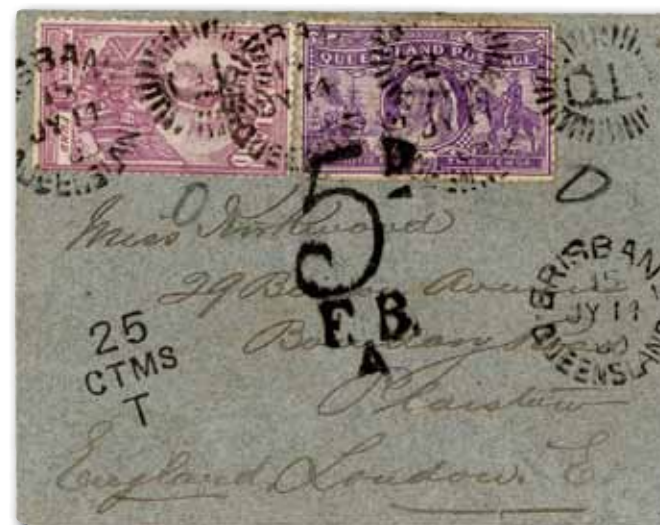
Anglo-Boer War Patriotic Fund, 1d and 2. on cover to London, taxed on arrival as not permitted by UPU!

Provenance: T.H.Chapman Frank Godden Noel Turner (1989)