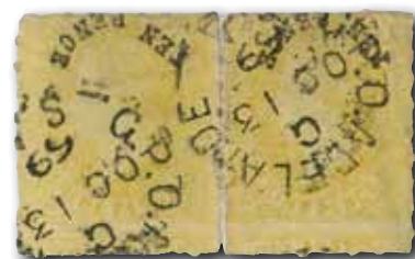
1860/69, ,TEN PENCE‘ Surchage Inverted at Top, rejoined pair!