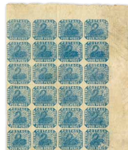
1854, 4d. pale-blue, unused block of 20.