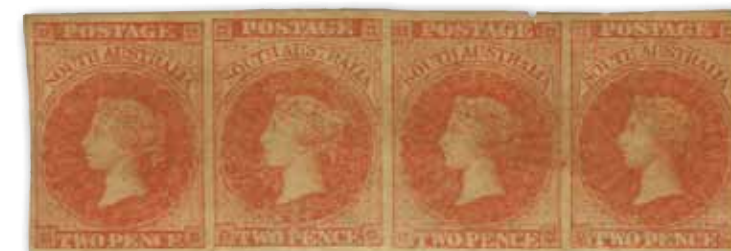
1856/58, 2d orange-red, mint strip of 4