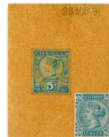
1891, De La Rue hand-painted Essays.