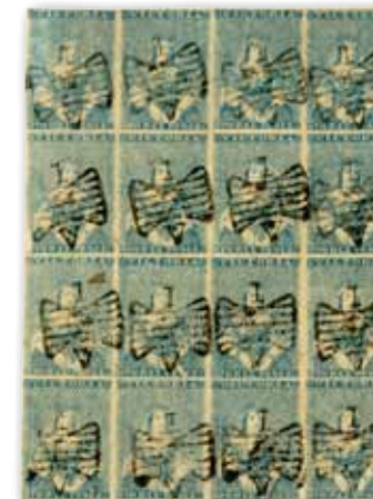
Ham Printing 1850, 3d. bright blue, the famous used block of sixteen!