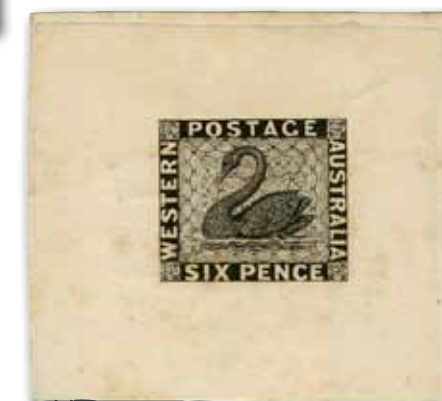
1860, Perkins Bacon Die Proof for the 6d.