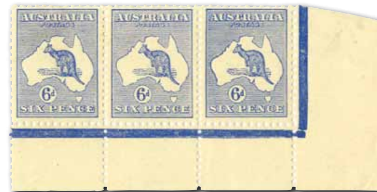
1913, 6d Die IIA, the substituted cliché, only two such positional strips recorded!