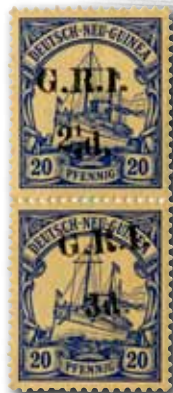
1914, 2 1/2d. in vertical pair with 3d.