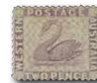
1879, 2d. mauve, Error of Colour, unused with large part o.g.