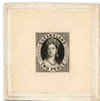
1860, 2d. die proof.

1903 Printing from lithographic stones from transfers taken from recess plates.