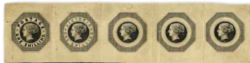
1854/1901, 1s. Composite Proof strip of five subjects, printed on the occasion of the Duke of York's (later King George V) visit to Australia in 1901. Only two or three struck from original dies.