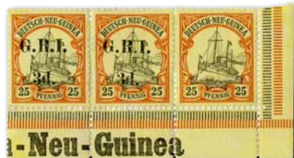
1914, 3d. "surcharge omitted" in pair with "normal 3d."