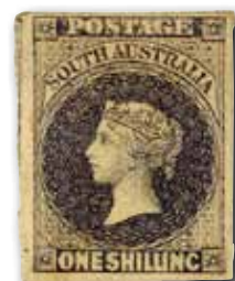
1855, 1s. violet, prepared for use but unissued! Only about 15 specimens recorded!