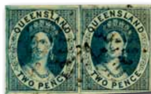
1860, 2d. blue imperf., used pair.