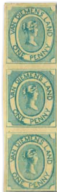
1853, 1d. pale blue, fine large part o.g. strip of three.