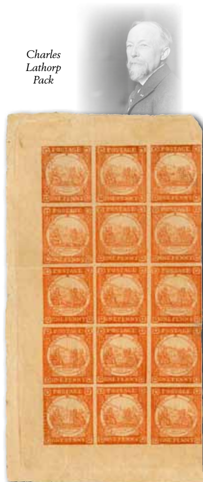
Sydney View 1d., proof blocks of 6 and 9 re-joined!