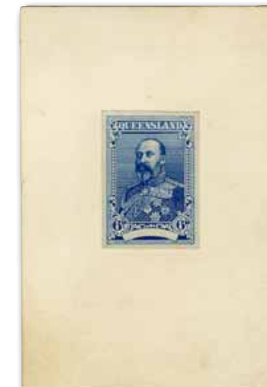
1903 (approx), Essay for proposed 6d. featuring the future King Edward VII.