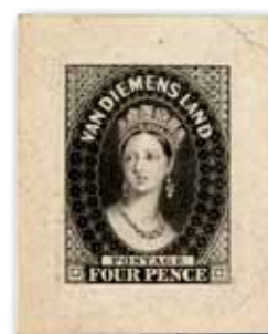
1854, Chalon Head 4d. die proof.