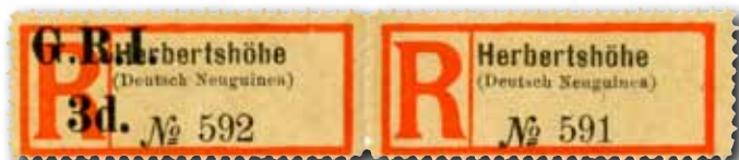
1915, Registration Labels surcharged, Herbertshöhe 3d. "surcharge omitted" in pair with "normal 3d."