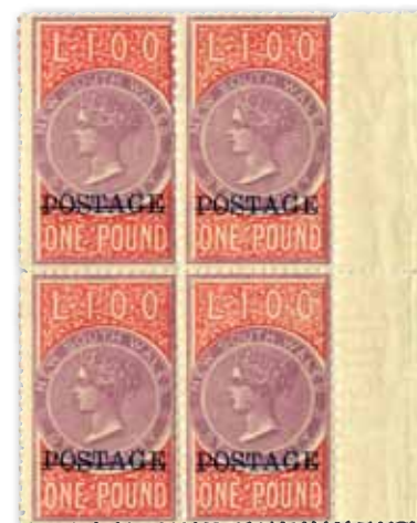
1885/86, ONE POUND overprinted "POSTAGE", largest known multiple!