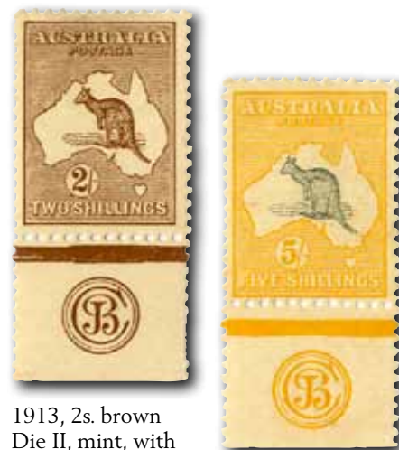
1913, 2s. brown Die II, mint, with 'JBC' monogram 1913, 5s. , Die II, mint, with 'JBC' monogram