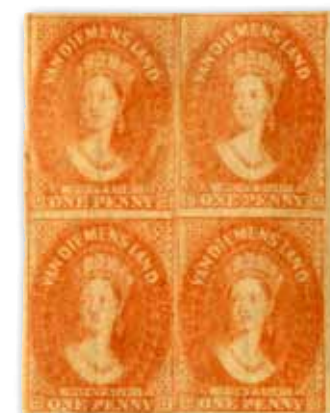
1857, 1d. pale red-brown, mint block of four.