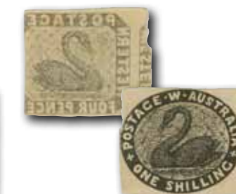
1854, Proof for the 1s. in black with offset of the Swan 4d. value on reverse. The offset with WESTERN/WESTERN side by side that ascertained the 'Centre Inverted' variety was an 'Inverted Frame'!