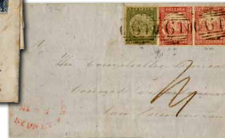
Sydney View 3d. and 1d. (pair), the famous cover to Van Diemen's Land.