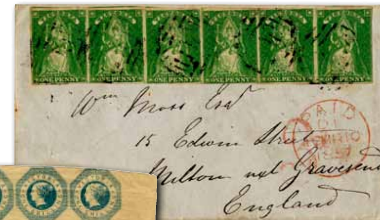
1856, Queen on Throne, 1d. strip of six on cover