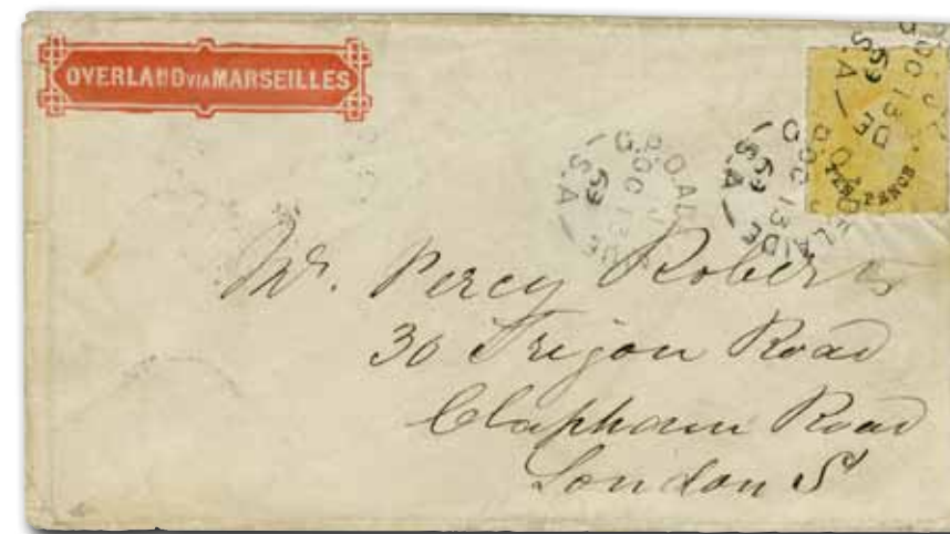
1860/69, ,TEN PENCE‘ Surchage Inverted at Top, the unique example used on cover. One of the true gems of South Australia!