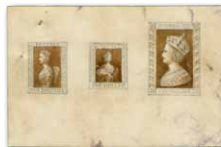
1854, The famous three hand drawn 1s. Essays for the 1854 tender!

Provenance: J.R.W. Purves (1980) Rod Perry (1987)