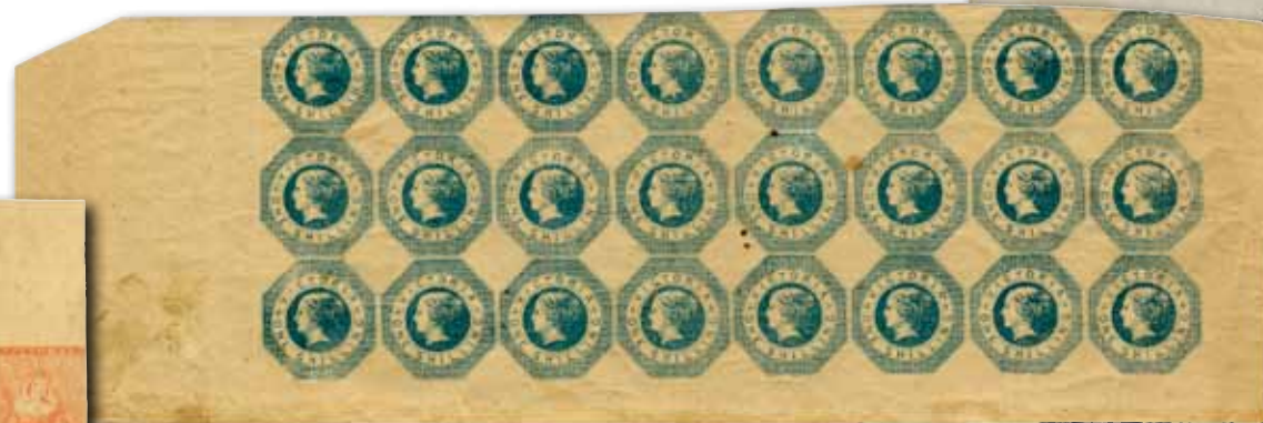
1854, 1s. dull slate-blue, the famous block of 24 discovered in 1981. Lithographed by Campbell & Fergusson.