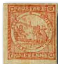
Sydney View 1d., plate I, unused.

Provenance: Philippe Ferrary de la Renotière (1922)