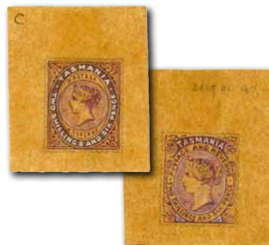
1886, De La Rue hand-painted Essays for proposed 2s.6d. design.