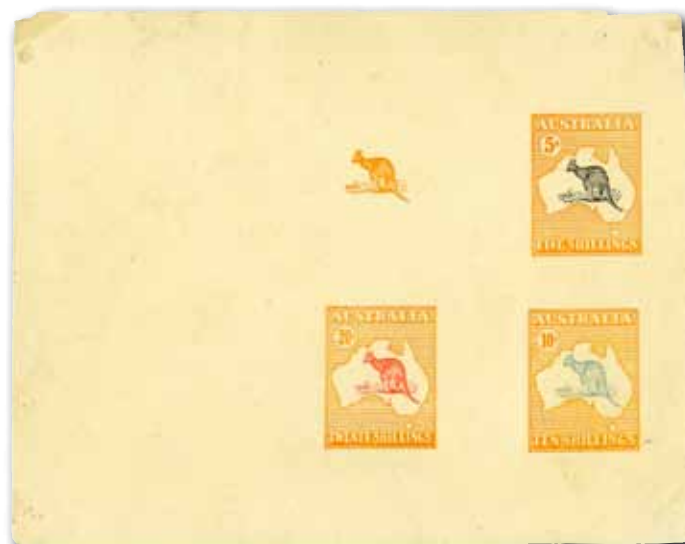
1912/13, Die Proof second unapproved design by Blamire Young.