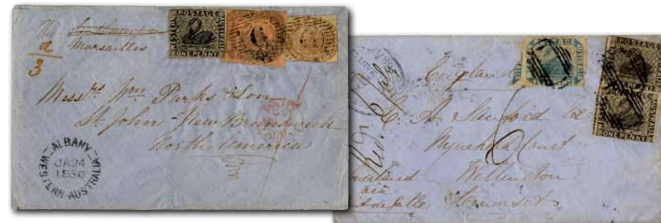
1858, 1d. black, 2d. black on brown and 1s. pale brown used on cover to New Brunswick

Provenance: Harmers sale 'Rarities of the World' (1964)