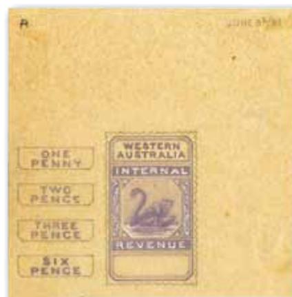
1881, De La Rue Essay for the Internal Revenue issue, handprinted