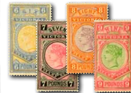
Stamp Duty: 1886/96, High Values, perf. 12 ½, wmk. Crown over V, only two examples of each recorded outside the Royal Collection of Her Majesty Queen Elizabeth II.