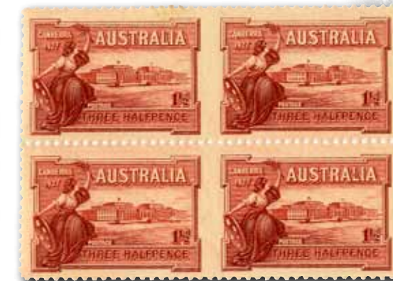
1927, Opening of Parliament House, Canberra, 1½d. variety imperforate between vertically