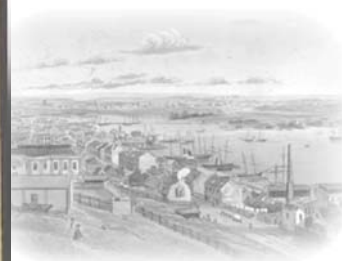
View of Sydney ca. 1860