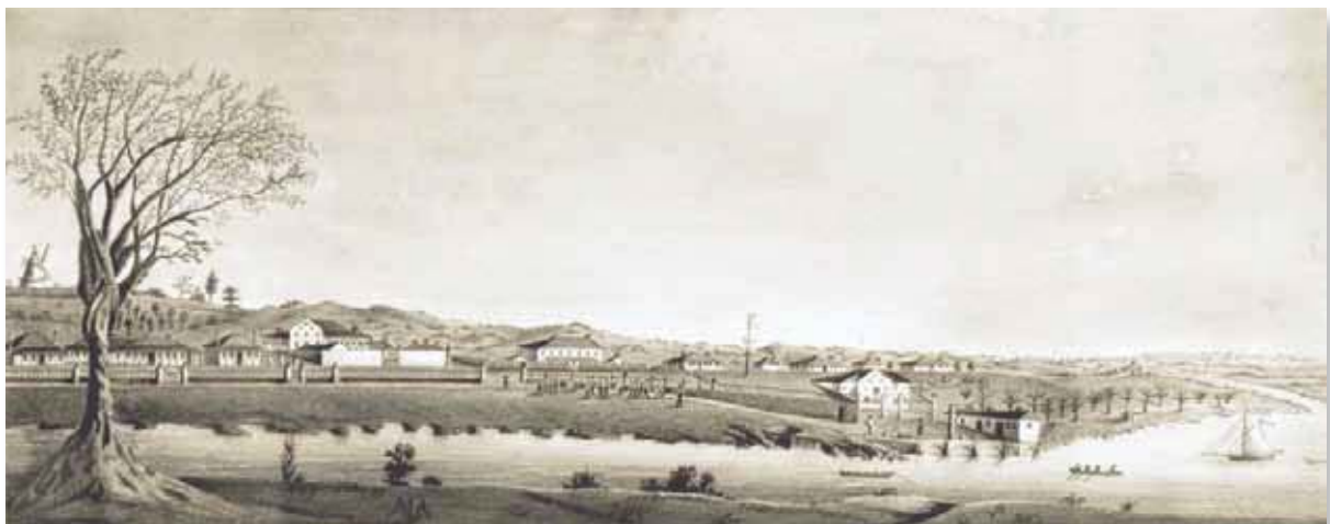
View of Moreton Bay ca. 1855