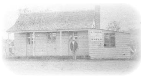
Bootmaker's Shop in Allora