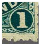
"Re-entry" under value tablet