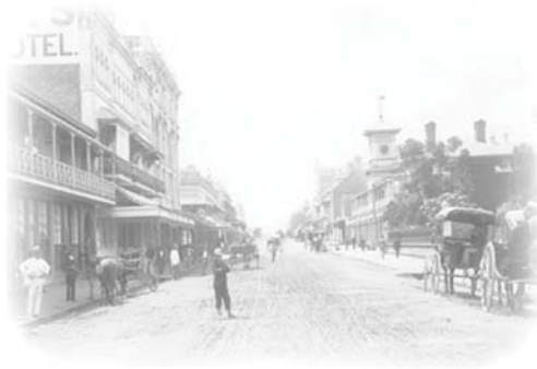
George Street, Brisbane