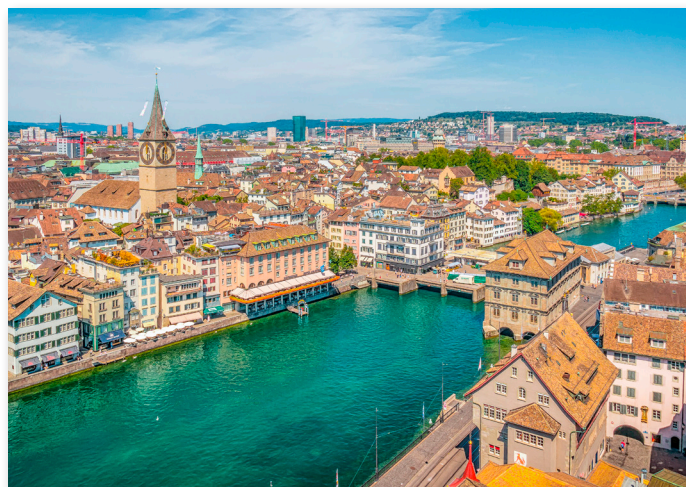
Corinphila Auctions are held at the International Financial Centre of Zurich.