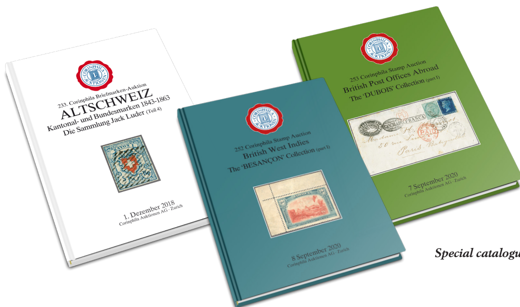
Special catalogues: a Corinphila speciality.