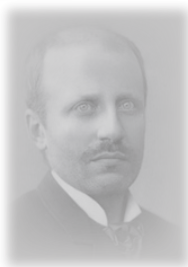
Philipp von Ferrary