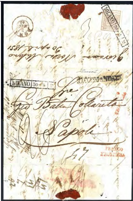
1851 Milan, Lombardy Venetia > Naples (ex collection M. Mentaschi) scarce registered letter, combination prepayment of registration fee of 30 cent by postage stamp 1st issue Lombardy Venetia + 15 cent cash (there are known very few of such combinations)