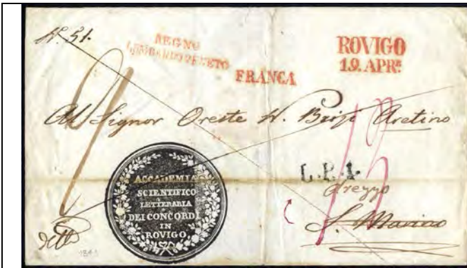
1841 Rovigo, Lombardy Venetia > San Marino (Republic) (ex collection F. Zanetti) beautiful and scarce letter due to markings and rates, less than 3 covers known from Austria & Lombardy Venetia to the Republic of San Marino