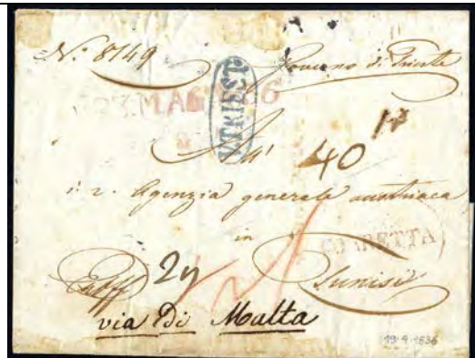
1836 Trieste, Austria > Tunis scarce international transit letter from Austria to this destination via Papal States, Naples and Malta, disinfected mail