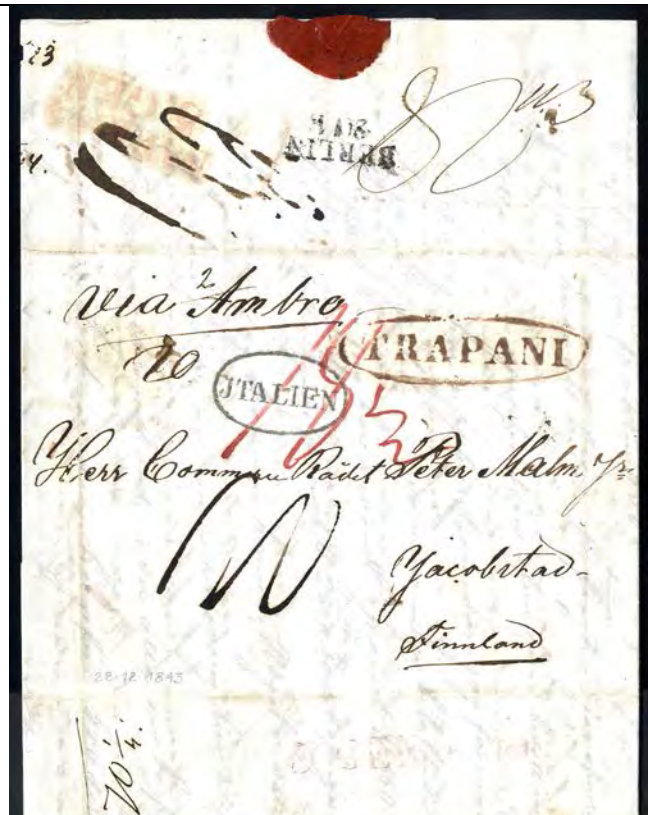
1843 Trapani, Sicily > Jacobstad, Finland (ex collection Dr. W. Hess) less than 5 covers known from all Old Italian States in this period known to Finland, excellent quality, rare destination, route, rate & transit markings