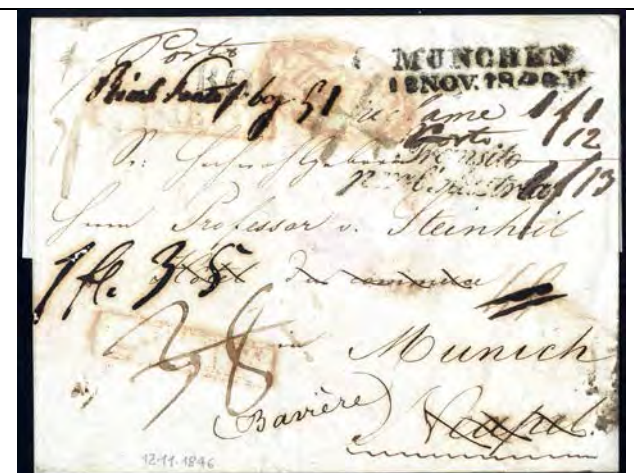
1846 Munich, Bavaria > Naples and return extraordinary transit mail letter through central & southern Europe, scarce transit markings and rates