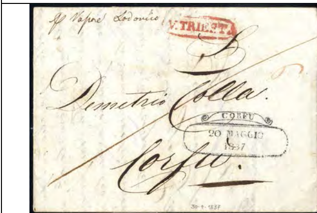
1837 Trieste, Austria > Corfu, Ionian Islands First day cover of Austrian Lloyd Steamship mail carriage, the only cover known