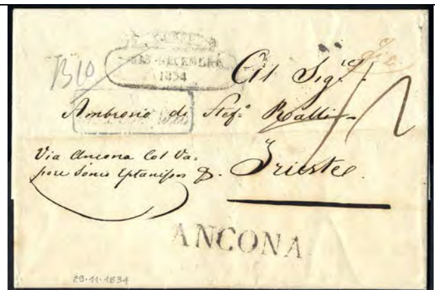
1834 Zante, Ionian Islands > Trieste, Austria only know cover so far with the endorsement of the ship „Eptaissos“, the pioneer steamship service in the Adriatic Sea, forerunner of the Austrian Lloyd