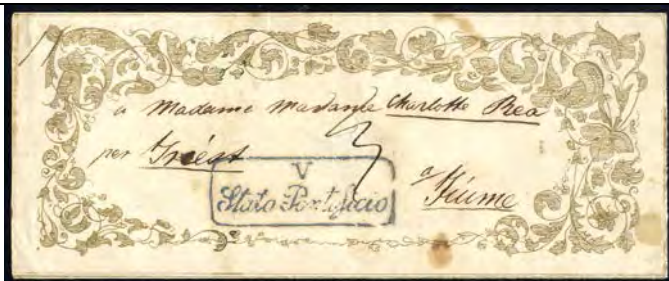
1842 Palermo, Sicily > Fiume, Austria Valentine letter of extraordinary quality, very scarce from Old Italian States and difficult to find in international transit mail