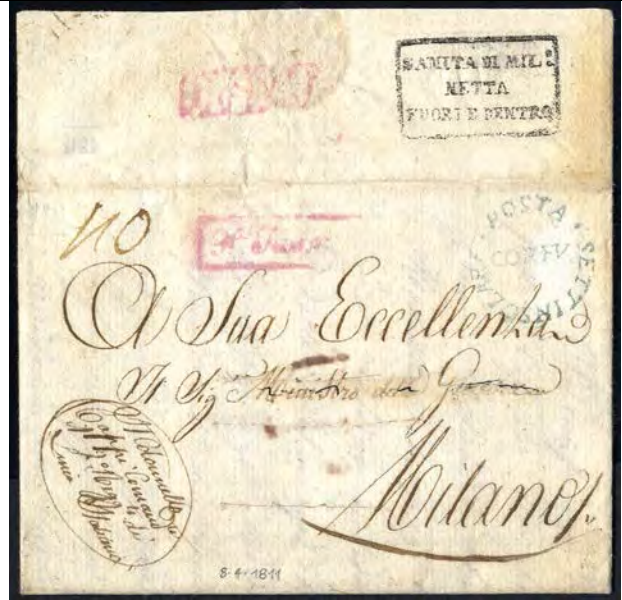
1811 Corfu, Ionian Islands > Milan (Napoleonic Kingdom of Italy) beautiful and scarce transit mail cover from Ionian Islands with scarce „Posta Settinsulare“ marking