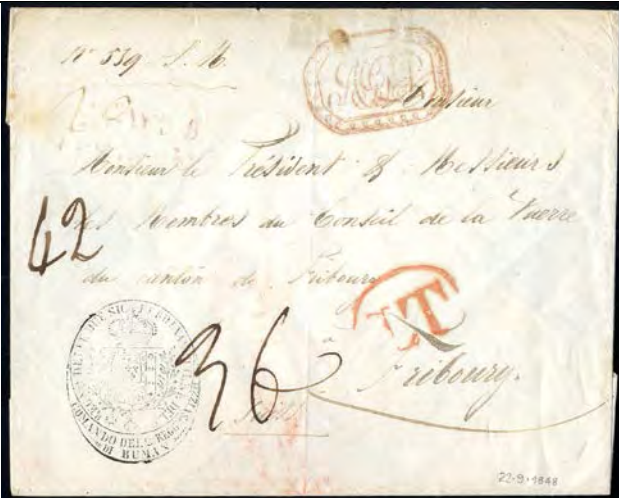
1848 Naples > Fribourg, Switzerland only known letter from the Swiss Military Division of King Ferdinand II to fight against 1848 „Risorgimento“ War, very scarce Military Post cachet „Buman“