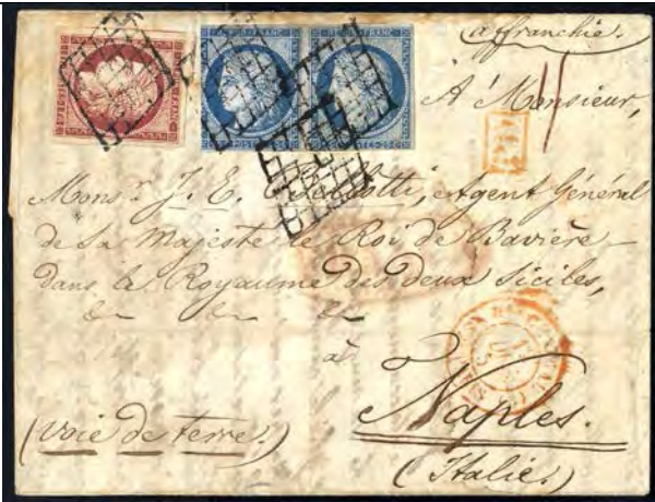
1851 Paris, France > Naples scarce 1.20 rate to Kingdom of Naples by 1 Fr + 2x10 cent postage stamp France 1st issue to Naples