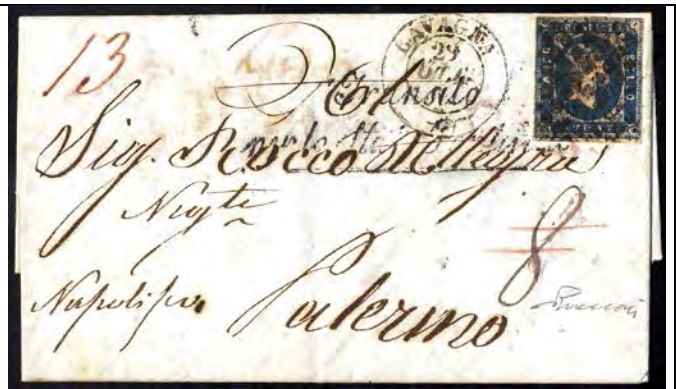
1851 Lavagna, Sardinia > Palermo scarce use of Sardinia postage stamp 1st issue to Sicily (all foreign mail covers with the 1st issue are scarce, Sicily is a difficult destination)