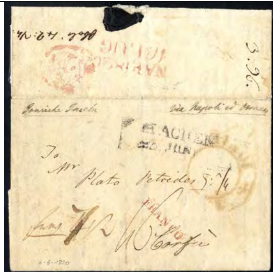
1820 Norfolk, UK > Corfu, Ionian Islands scarce international transit letter from UK via Prussia, T&T, Bavaria, Austria, Papal States and Naples to Ionian Islands