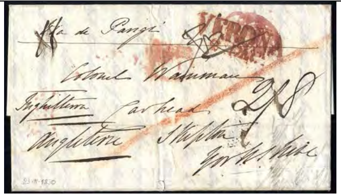
1830 Naples > Skipton, UK rare „Metternich“ smuggled letter, with the rare handstamp „VERONA“ in red (less than 5 covers known)