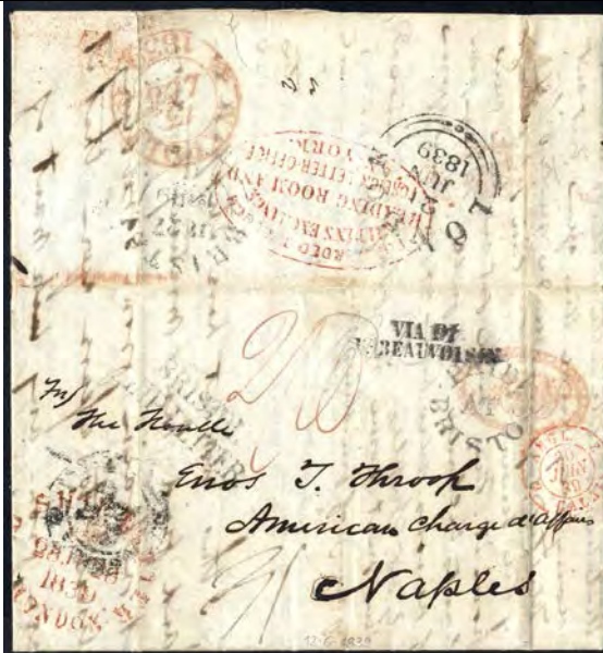
1839 New York City, USA > Naples beautiful transit letter, sent by Pioneer Steamer „Great Western“ with destination Old Italian States (direct mail to Italy without forwarder <1850 is very scarce)