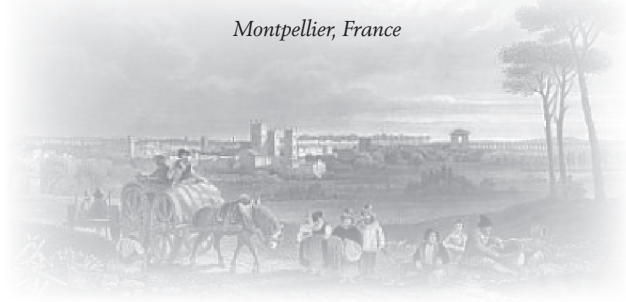
14 May 1867, Letter from Galatz franked double-headed eagle 10 soldi (4) carried by Danube Steam Navigation Company ship dispatched from Galatz via Vienna to Montpellier. "Galatz 14/5" marking in manuscript on vertical 10 soldi pair. Unique letter bearing this franking!