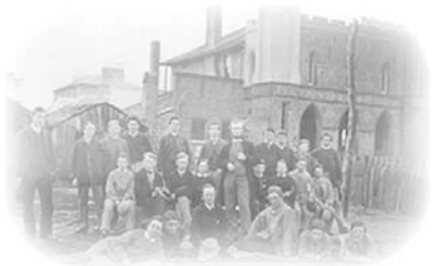
Bishop's School, Perth