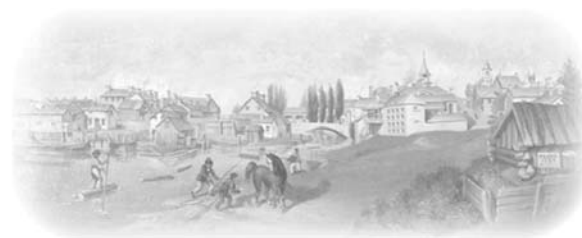
View of Perth ca. 1860