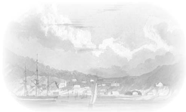
King George's Sound