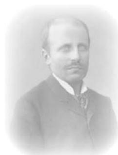
Baron Philipp von Ferrary