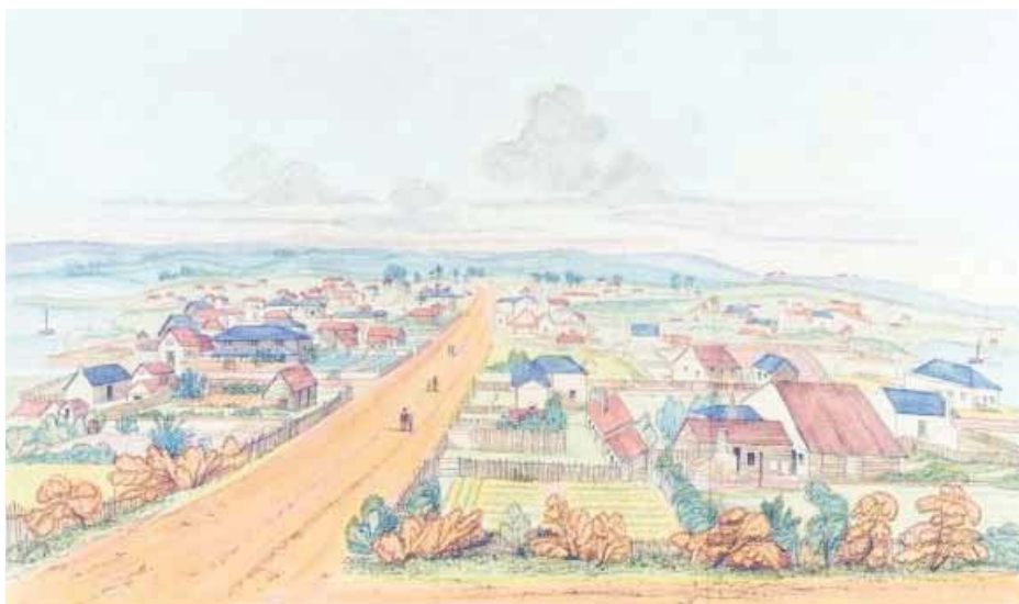
The Town of Fremantle ca. 1835