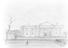
Supreme Court in Adalaide South Australia