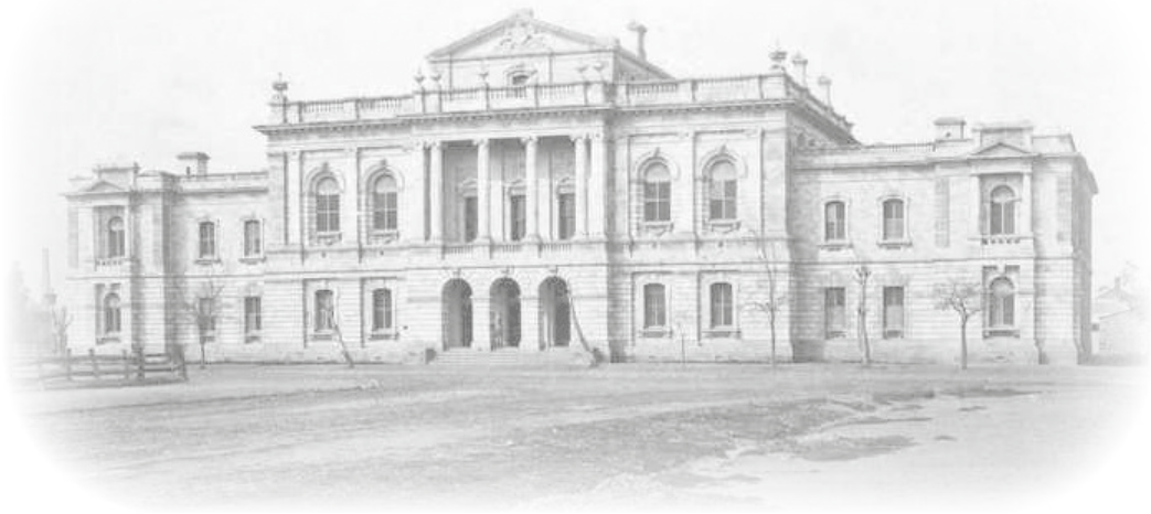
Magistrate's Court Adelaide