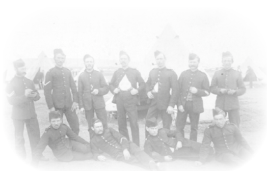
Volunteer Military Forces