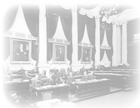
Interior of the House of Assembly