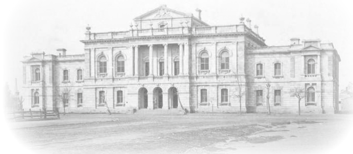
The Office of the Attorney General at the Magistrate's Court Building in Adelaide