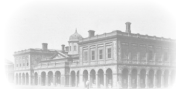
The Customs House in Adelaide