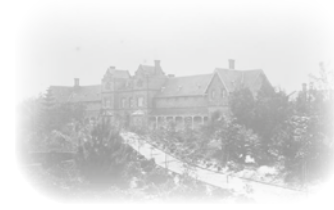
Lunatic Asylum in Hackney South Australia