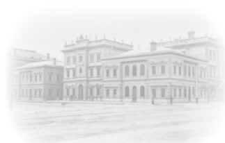
Treasury Building of South Australia in Adelaide