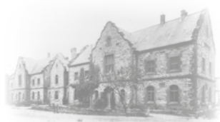
Destitute Asylum in Adelaide