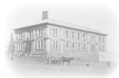
Gouvernement Printing Office King William Road, Adelaide