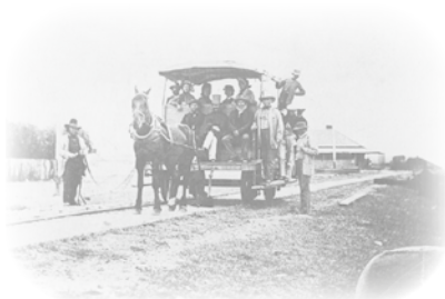
The Goolwa—Port Elliot railway was the first railway in South Australia