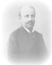
Philipp von Ferrary