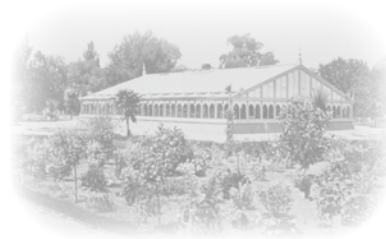
View of the Botanical Garden in Adelaide

4531 1869/74: Overprinted "B.G." in black, on 1 d. deep yellow-green, wmk. Large Star, perf. 11½ x rouletted, a fine unused example of very fresh colour and large part og. Superb. Butler 6R. Cert. Ceremuga (2018).