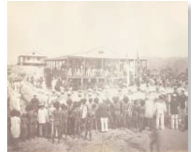
Reading the proclamation of annexation, Port Moresby, New Guinea