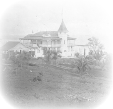
Government House in Rabaul