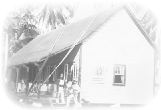
Post Office in Jaluit