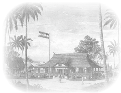
German New Guinea Post Office