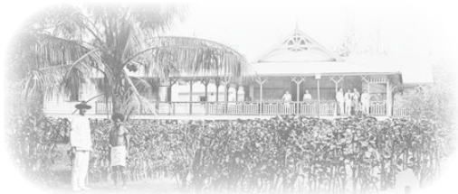
Mess Hall in Rabaul