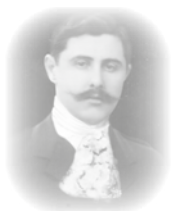
John Crichton-Stuart, 4th Marquess of Bute 1881-1947