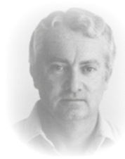
Robert Martin Gibbs

3978 1 d. on 2 d. on 20 pf. ultramarine, Setting 2, position 1, a fine unused example with sheet margin at left, slightest of diagonal bends at top and the sheet margin reinforced with hinge, a fine og. example of an extremely rare stamp. Signed Herbert Bloch. Cert. BPA (2017) Gi = £ 4'000.