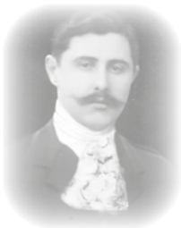
John Crichton-Stuart, 4th Marquess of Bute 1881-1947