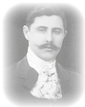
John Chrichton-Stuart (1881-1947) 4th Marquis of Bute