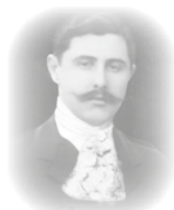
John Crichton-Stuart, 4th Marquess of Bute 1881-1947