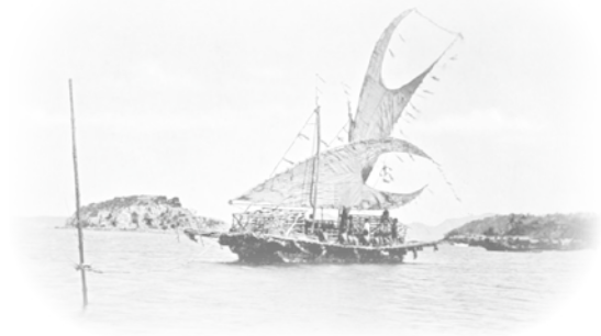
Lakatoi of Papua New Guinea