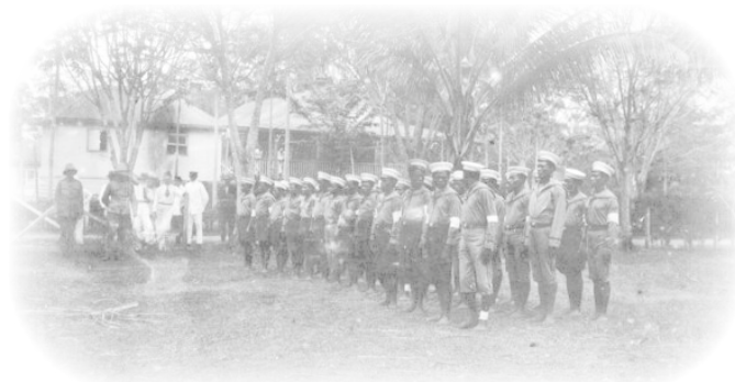
German Headquarters after capture by the Australian Navy and Military Expeditionary Force