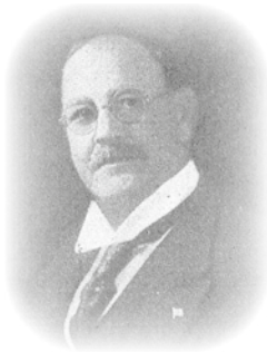
Col. E. H. R. Green

3989 'O.S. / GRI' 1 d. on 3 pf. brown, Setting 3, the famous vertical pair, marginal from base of sheet with "Guinea" imprint, upper stamp with variety " Surcharge Double ", lower stamp normal, fresh and very fine with superb og. Gibbs states that the double surcharges were all found on the same sheet in vertical pairs from horizontal row 9 (page 106-107 in the handbook) and traces 9 existing examples. Illustrated in Gibbs on page 106. A wonderful and rare pair, in the foremost quality. Signed Herbert Bloch, Hermann-Giesecke. Cert. BPA (1981) Gi = £ 5'500+. Provenance: Collection Colonel E. H. R. Green, Harmer Rooke, New York, 25-29 March 1946, lot 869. Corinthila sale 80, March 1990, lot 6731.