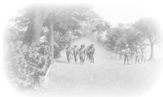
Surrender of German troops in Herbertshöhe