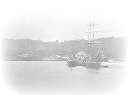
Vessels in the Harbour off Rabaul