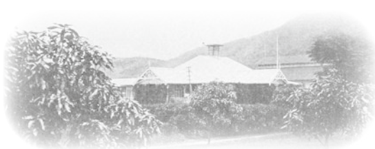
German Imperial Post Office in Rabaul