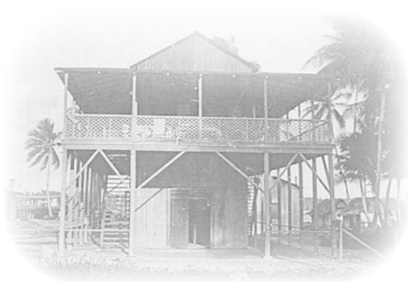
Commonwealth Bank of Australia opened its first branch in Kāwieng mainly to serve the needs of the military administration and the Australian soldiers