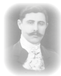
John Crichton-Stuart, 4th Marquess of Bute 1881-1947