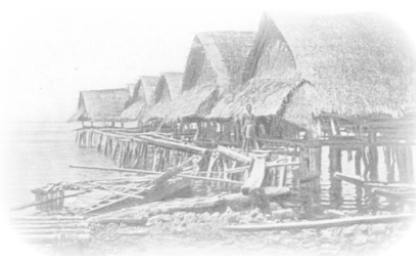
Native houses in New Guinea