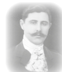
John Crichton-Stuart, 4th Marquess of Bute 1881-1947