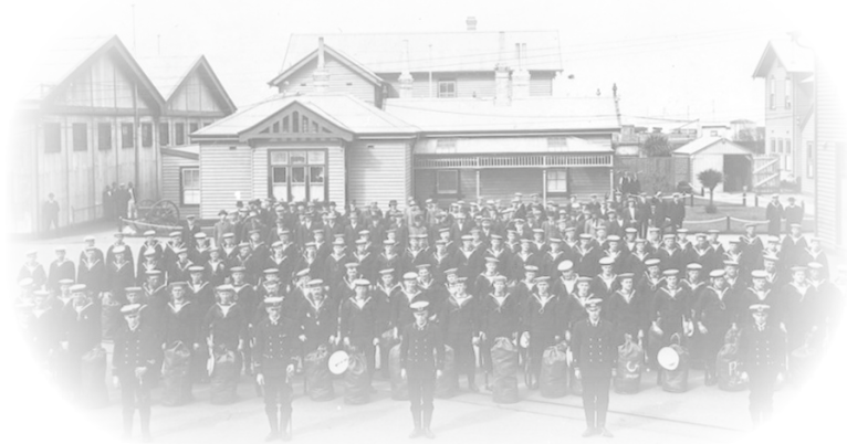
Australian Naval & Military Expeditionary Forces