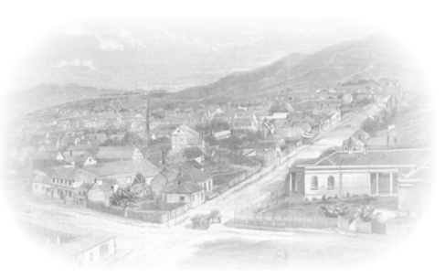
View of Wellington

1 s. green, no wmk. on blued paper, a used example with just touched to large margins and portion of adjoining stamp at left, on 1859 cover from Wellington to Liverpool endorsed 'via Marseilles', tied ny numeral '10' obliterator in black. Reverse with Wellington despatch cds (July 2) and Liverpool arrival cds (Oct 8) struck in blue. Slightest of file folds but a very rare stamp on letter and extremely fine for this rarity. Cert. RPSL (2006).