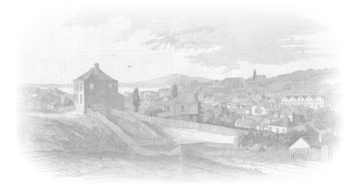
View of Auckland