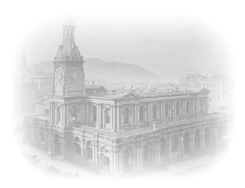
Princess Street in Dunedin

1634 1 s. deep green, on pelure paper, perf. 13 at Dunedin, a fine example of magnificent colour, used on cleaned 1863 cover from Dunedin to Glasgow, endorsed 'via Marseilles, under 1/2 oz', tied by barred DUNEDIN oval handstamp in black. Reverse with 'Dunedin / Otago' cds (April 18) and Glasgow arrival cds (June 12) in black. An attractive and scarce cover. Cert. Holcombe (1988) Gi = £ 2'000 off cover.