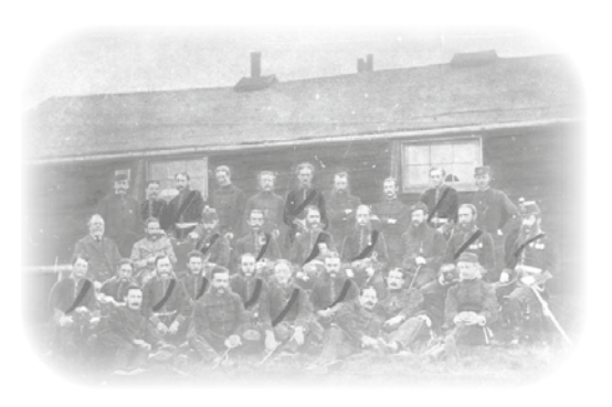
57th regiment in New Zealand