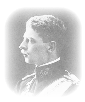
King Carol II of Romania

3 d. lilac, no wmk., on pelure paper, the famous unused example with margins all round except touched at upper left, of fresh true colour, minor corner bend slightly soiled, unused without gum. Despite faults, this is a major rarity of New Zealand philately - only two examples are recorded - both are unused. Signed H. Bloch, P. Holcombe. Cert. Friedl (1976), Holcombe (1988) Gi = £ 50'000.