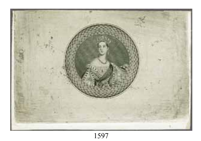
1853/55: Essay prepared by Perkins, Bacon & Co., showing the Chalon half-length portrait engraved by William Humphrys printed in black on smooth surfaced white paper (76 x 50 mm.), with superb cross-hatched 'engine-turned' background and circular frame divided from the portrait by white circle (State 2). Rare and most attractive frontispiece for a specialised Chalon collection.