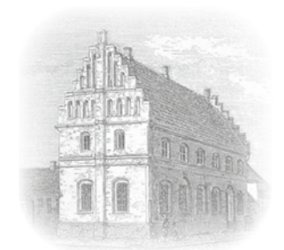
Ribe Town Hall