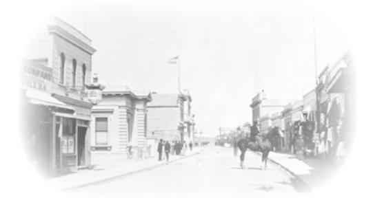
Revell Street, Hokitika