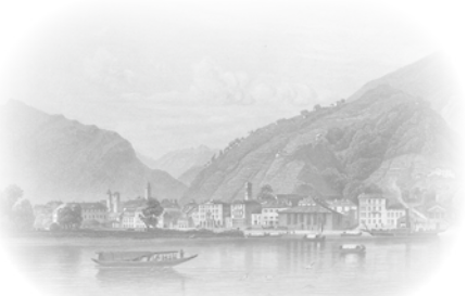
View of Locarno

3 d. lilac, perf. 12½, three examples of good colour, all used on 1872 cover from Hokitika to Locarno, Switzerland tied by good strikes of "W" handstamps (Waimea) in black with manuscript '3' credit in red alongside. London transit cds on front (May 13) and circular PD. Reverse with slight flap fault but showing HOKITIKA despatch cds (March 15) in black and Locarno arrival cds (May 17) alongside oval 'Giumaglio' handstamp in black. Minor imperfections as stamps applied just off edge of cover but a scarce destination and a most attractive usage. Cert. RPSL (2002).