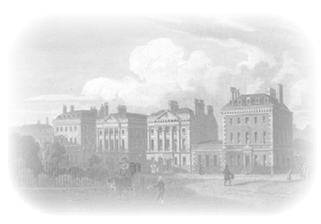
Cavendish Square, London