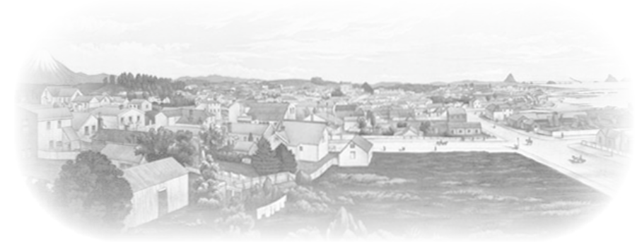
View of New Plymouth