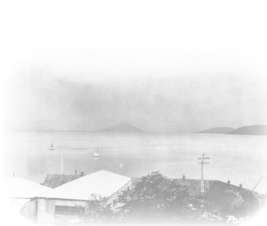
View of Port Moresby