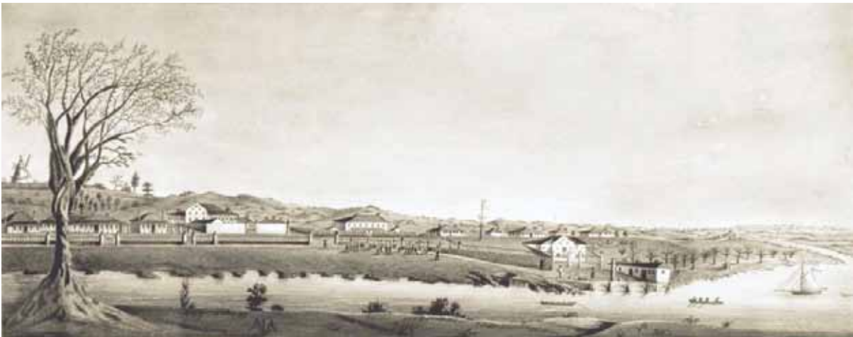
View of Moreton Bay ca. 1855