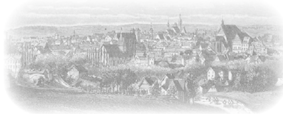
View of Freiberg, Germany

Provenance: Collection Leslie Digby Nelson, Grosvenor, London, 4 Oct 2012, lot 71.