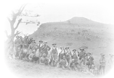
Boer Militia Men