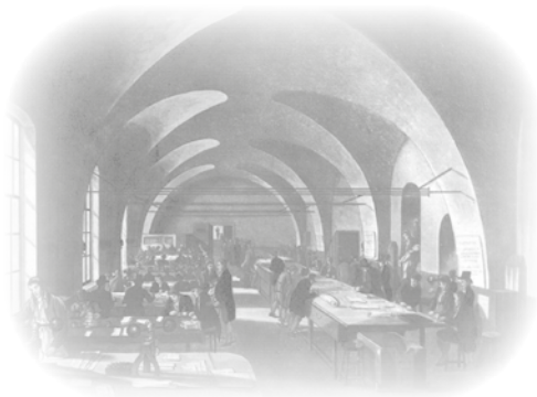
The Stamp Office, Somerset House