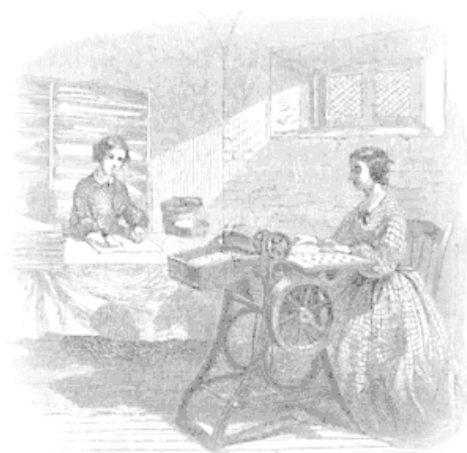
Early Rotary Perforating Machine