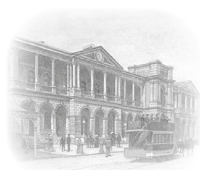
Brisbane General Post Office