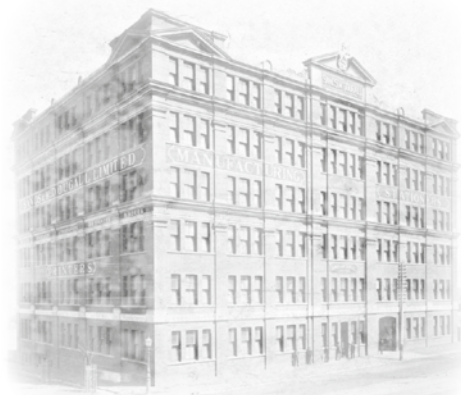
Office of Sands & MacDougall in Melbourne

3622 1897: Die / Plate Proof in black for 1½ d. value on cream wove paper, 50 x 64 mm., engraved by Arthur Williams of Sands & MacDougall and typographed at the Victorian Government printing Office. An example possibly of Plate Proof status from top right corner of a sheet, with manuscript "White Paper & Green ink 5/10/97 120 on a sheet", this being dated two days prior to the issue of the 1½ d. in apple-green. Fresh and very fine, a remarkable Proof, being the sole recorded example.