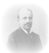
Philipp von Ferrary