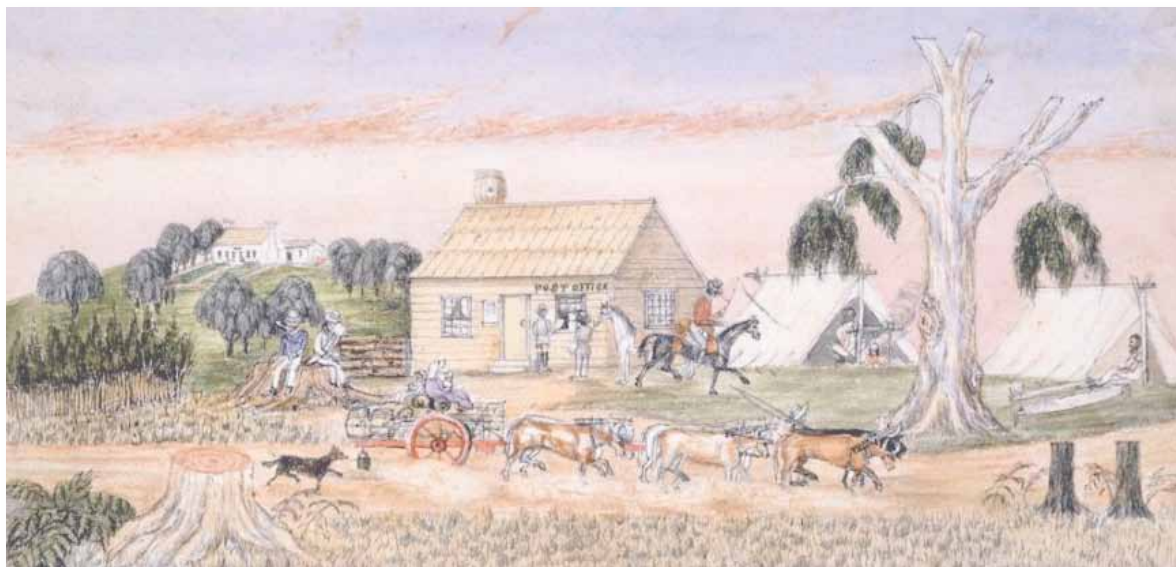
First Post Office in Melbourne, 1841