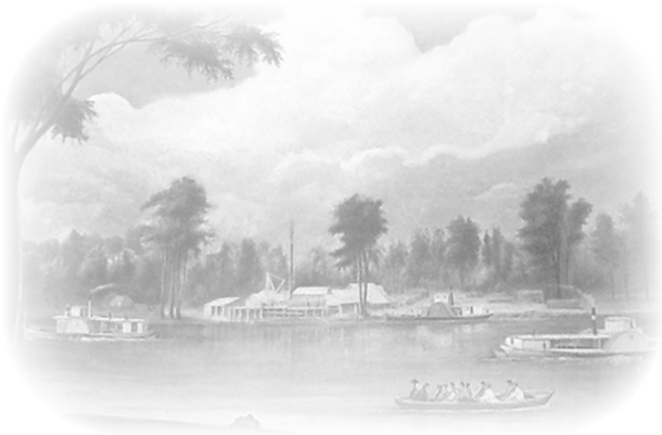
Paddle Steamers on the Murray River