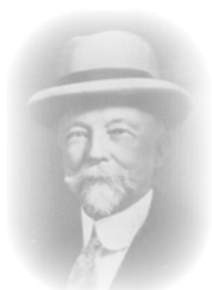
Charles Lathrop Pack