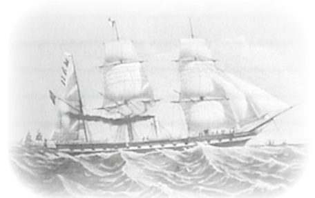
'Argo' of the General Screw Steam Shipping Co.

Note: The "Argo" of the General Screw Steam Shipping Co. arrived at Southampton with Gold dust & Jewels valued at £ 310'918, together with 138 cases of material for the Paris Exhibition.