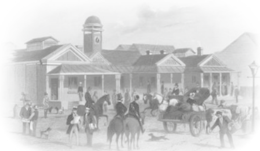
Melbourne Post Office