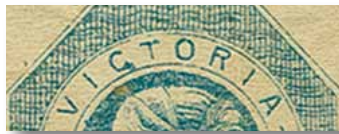
"VICTORIA" for "VICTORIA"