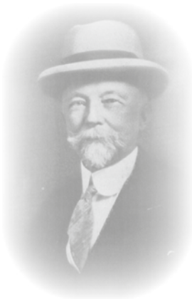
Charles Lathrop Pack