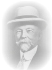
Charles Lathrop Pack