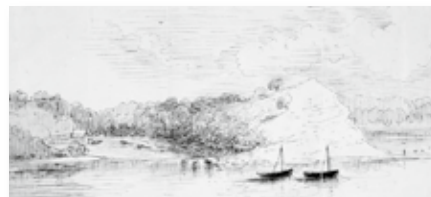
Sullivan Bay, Port Phillip in 1803