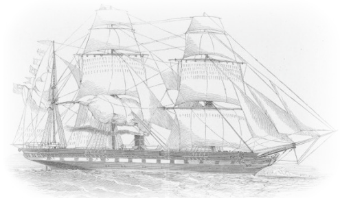
The 'Croesus' steamer