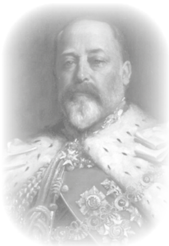
King Edward VII

Die Proof for £ 1 value in salmon, on slightly yellowish folded wove paper, 63 x 107 mm., State 2 without the two white dashes below the beard, some minor spotting and scuffs but of great rarity.