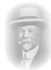
Charles Lathrop Pack