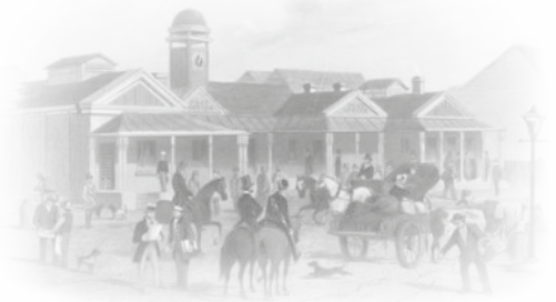
Melbourne Post Office