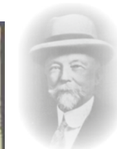
Charles Lathrop Pack