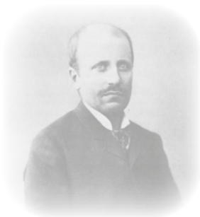
Philipp von Ferrary