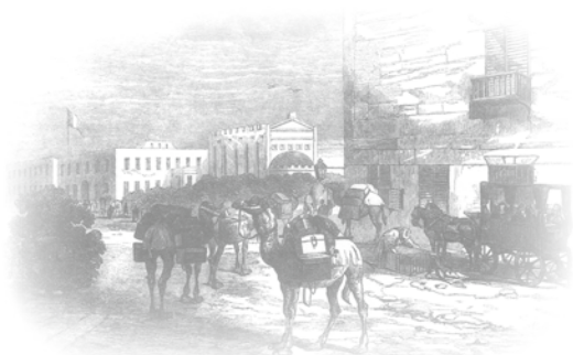
Arrival of the overland mail in Alexandria