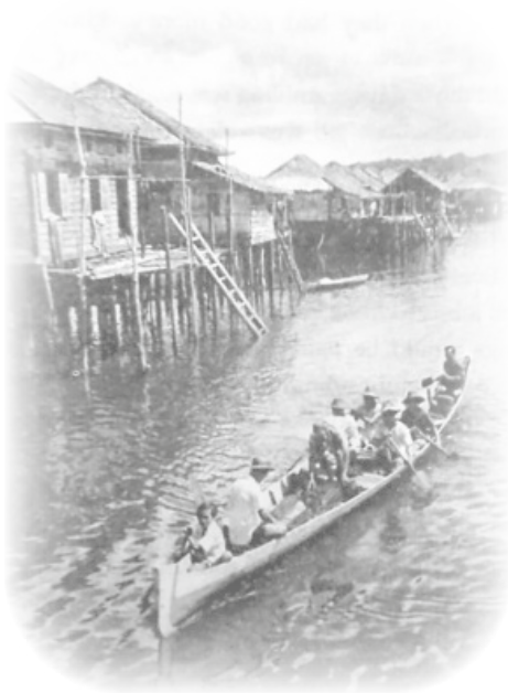
On the water in Brunei