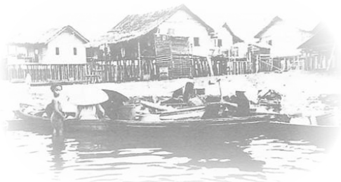
A village along the Brunei River