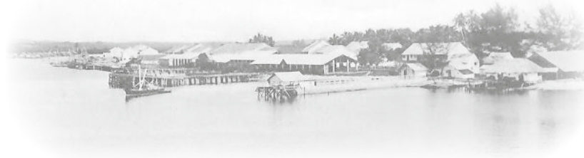
Victoria Harbour, Labuan