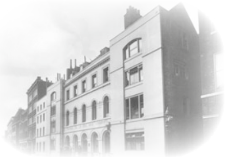
The premises of De La Rue

4510 1906: De La Rue composite Essay for the 25 c. value, inset in thick card (80 x 95 mm.) with the frame in emerald-green overlaid on the vignette in green (manuscript at top "Not to be followed for View" in pencil), the Duty Plate "25 c" being hand-drawn in pencil on background of Chinese white. Dated at top "June 7th 06" in ink and further manuscript at base "To be printed in 2 colours as design in 2 colours". The duplicate Proof (held by De La Rue) is illustrated in "The De La Rue Collection" edited by Frank Walton RDP on page 2414, this example shown to the Crown Agents, who accepted the bicoloured design on June 14, 1906. A wonderful and unique Essay. Provenance: De La Rue archives, RL, 1976. Christie's, London, 1994.