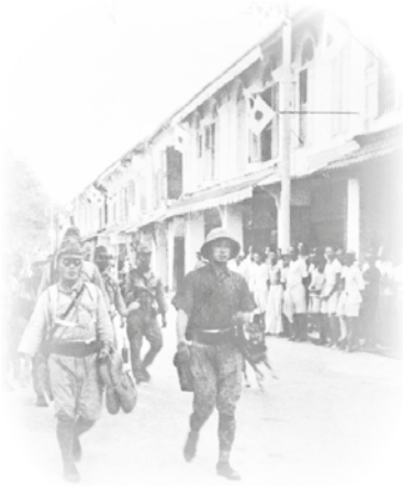
Imperial Japanese Army in Brunei