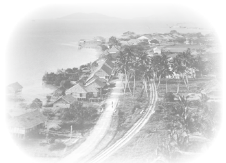
View of Jesselton