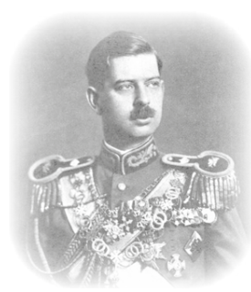
King Carol II of Romania