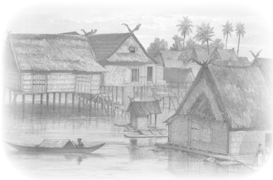
House in Brunei