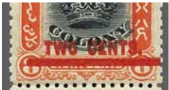
"Overprint TWO CENTS Double"