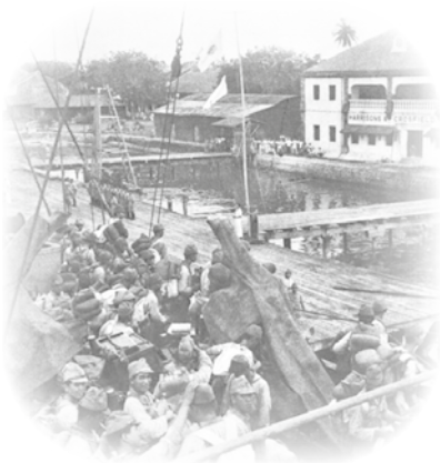
Japanese landing off the coast of Brunei

Gibbons Start price in CHF Start price approx. € J18 田* 2'000 (€ 1'840)