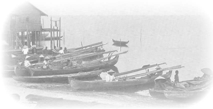
Native fishing in Brunei