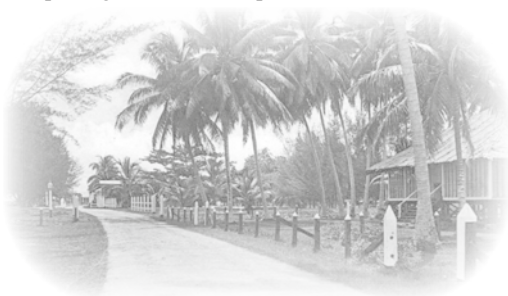
Principal Street Labuan