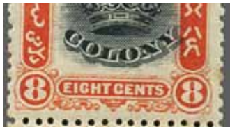
"TWO CENTS Omitted"