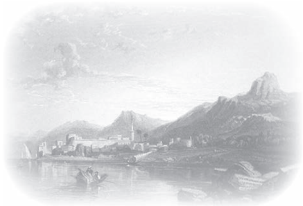
View of Cyprus