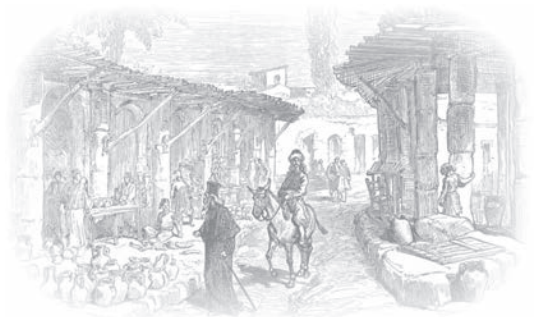
The Bazaar in Larnaca