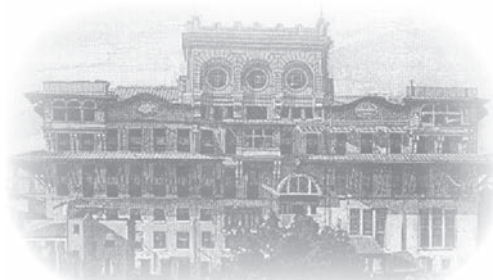
Imperial Ottoman Bank in Constantinople