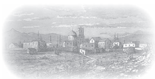
View of Larnaca